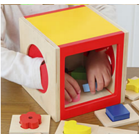
“Touch and Guess” game

With this project one of my goals is to create something that can be experienced without seeing or hearing. Without hearing, the user can still learn by touching the surface and reading about the sound they are feeling. And while seeing the surface would provide visual clues as to which frequencies are the loudest, it is not necessary for the interaction. In fact, the device could be presented like a “touch and guess” game where the user cannot see the device as they interact with it, allowing them to focus on the tactile feedback.