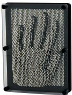
Pin art toy

I propose a device that allows someone to explore sound through physical touch. The object is a three dimensional spectrogram made up of an array of pins, similar to a pin art toy. The pins are motorized and can take the form of any sound file used as an input, creating a 'landscape' representing the sound's frequencies over time. Like a plasma ball, the user interacts with the surface by touching it -- Capacitive sensors in the pins allow for touch detection across the surface.